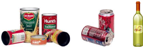
Tin, Metal Cans & Aluminum Cans, Glass (all colors)